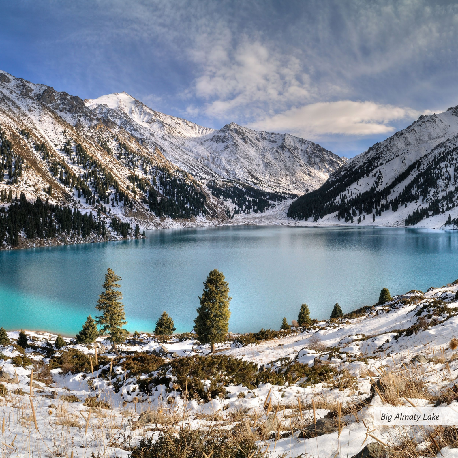
Big Almaty Lake